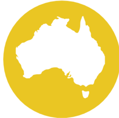
MIGRATION TO AND FROM OTHER PARTS OF AUSTRALIA