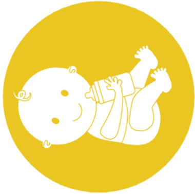
BIRTHS AND DEATHS