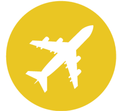
MIGRATION TO AND FROM OVERSEAS